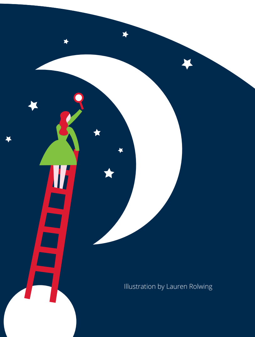
Illustration by Lauren Rolwing

*UK NARIC is the designated United Kingdom National Agency for the recognition and comparison of international qualifications and skills. It performs this official function on behalf of the UK Government.